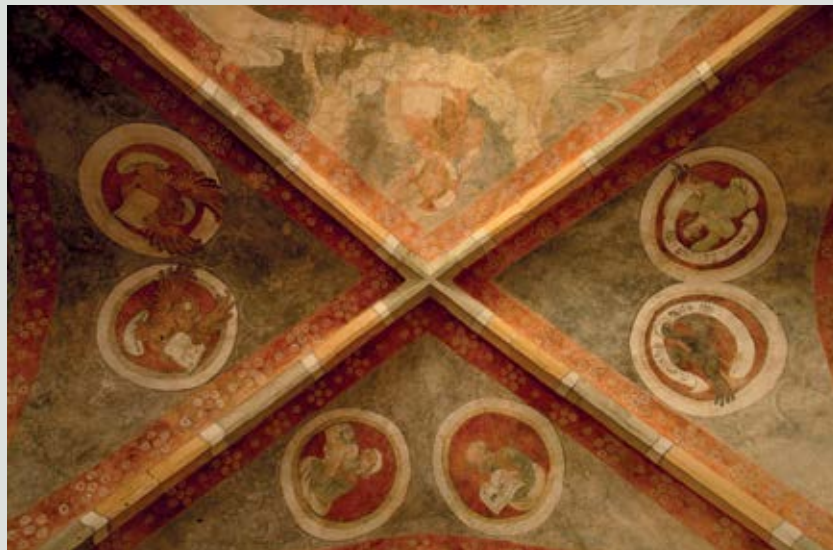
Ceiling vault of the Church of St. Peter