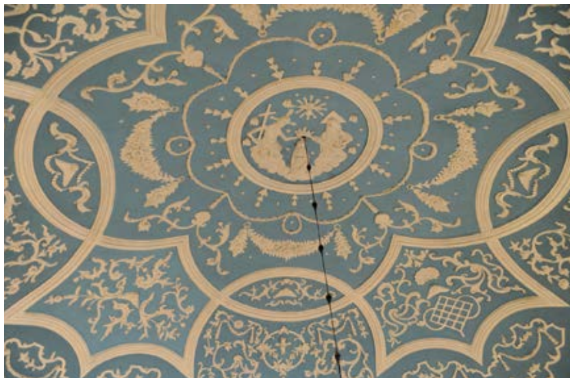
Ceiling vault of the Parish Church of the Most Holy Trinity

☎ Parish office, T 01 3370 755, E zupa.svnedelja@gmail.com