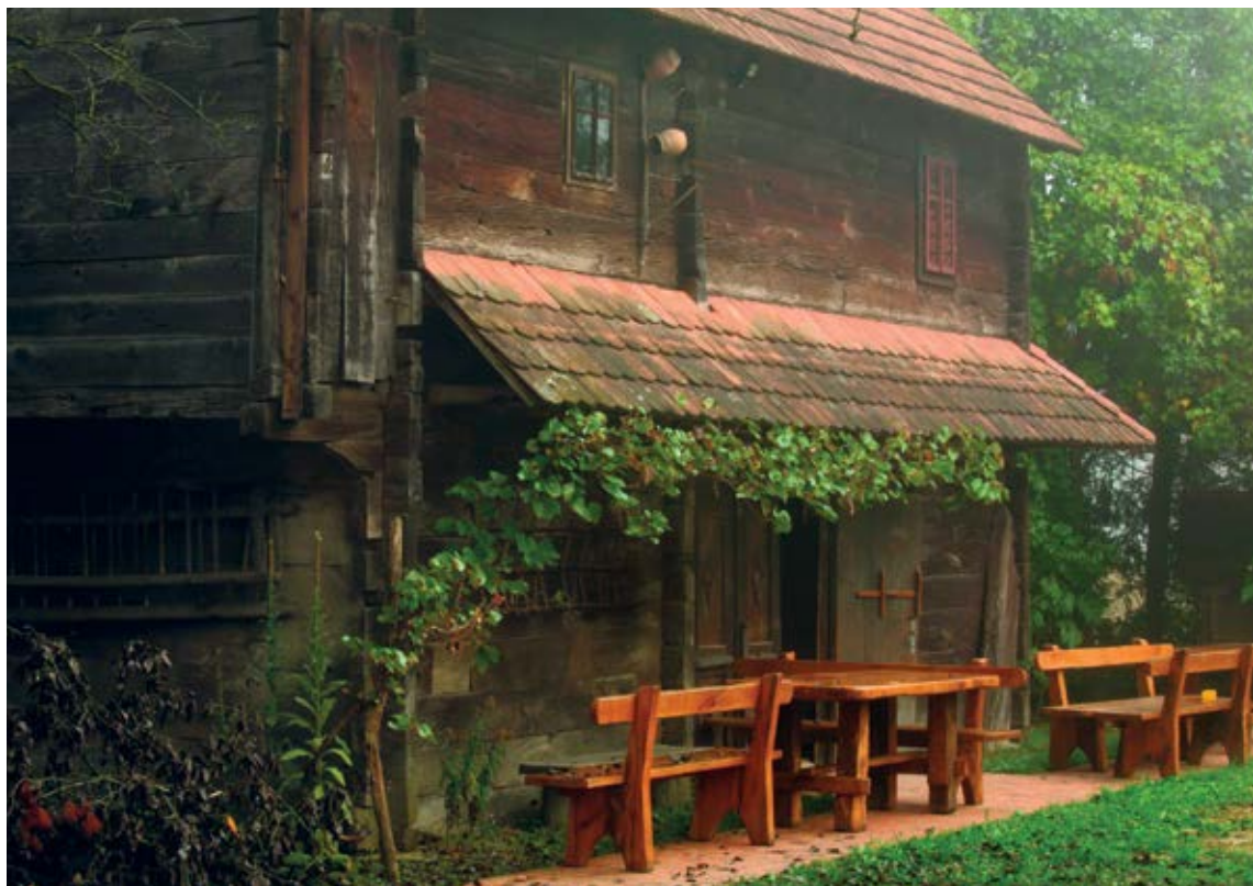
One of the outbuildings, Donja Kupčina Heritage Museum

THIS IS A MUNICIPALITY that forms a part of the Turopolje region, and it is known for its wooden architecture of houses, churches, stables and barns. Unfortunately, this form of architecture is disappearing before our eyes, particularly the rural wooden structures. For this reason, the ethno-park established in Donja Kupčina is of the utmost importance, as these simple wooden structures are protected.