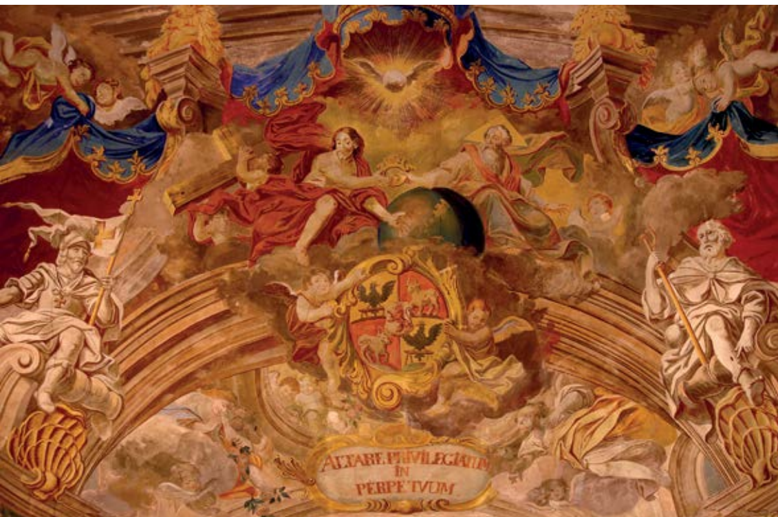
Franciscan monastery and the Church of the Assumption of the Blessed Virgin Mary