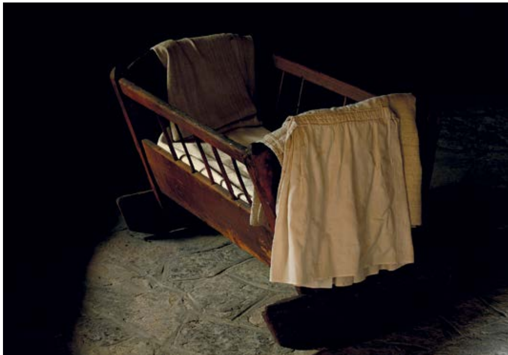
Žumberak Uskok Museum

It was opened in 2006 in the former outbuilding of the Greek Catholic parish house. The large collection of ethnographic objects testifies to