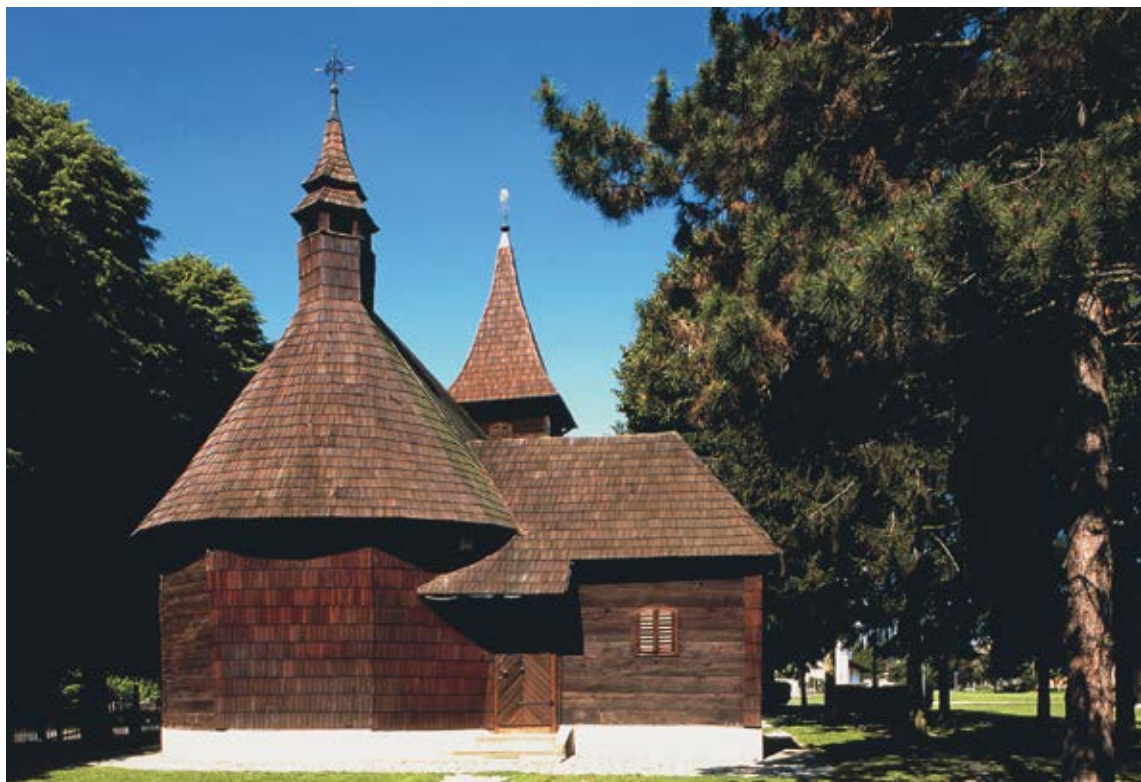
Chapel of St. Barbara, Velika Mlaka

VELIKA GORICA WAS FIRST mentioned as the seat of the parish in 1228. The main square, including the parish church and the Turopolje Council hall building, is a fine example of a medieval trading town which arose through spontaneous development since the 14 th century. The urban structure of the settlement was based on the topography and the main road Zagreb–Sisak. That street is lined with residential houses and crafts' shops from the second half of the 19 th century and the early 20 th century. In certain parts of the town, examples of the traditional wooden architecture are still visible.