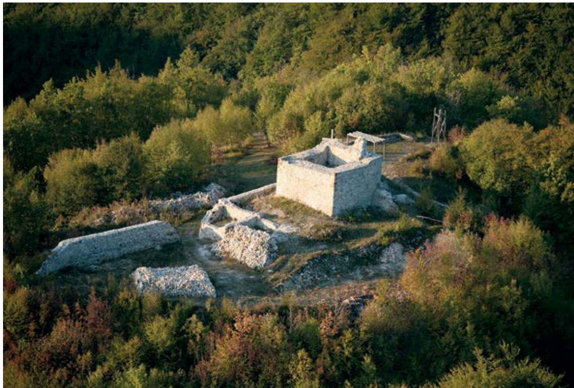
Žumberak Old Town

ŽUMBERAK IS A POORLY INHABITED mountainous region, west of Zagreb. Part of the mountain extends into Slovenia, where it is called Gorjanci. This is actually a chain of mountainous areas: Žumberačka Gora, Samoborsko Gorje and Plešivica. This is an area of exceptional natural beauty and significance, and has been protected as a nature park. However, Žumberak is also important as a historical rural landscape, a site of many archaeological discoveries, old churches and a