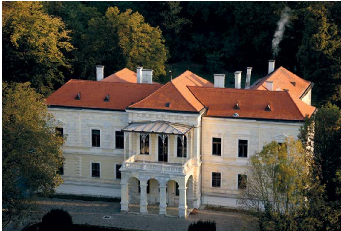
Vranyczany-Dobrinović Palace, Laduč

THE SETTLEMENT AND MUNICIPALITIES of Brdovec, Dubravica and Marija Gorica are situated in the Sava-Sutla Valley, and the surrounding hills. This area is also called Sutlansko Prigorje. To the west, the Sutla River forms the border with Slovenia, to the south lies the Sava River, several kilometres to the east is the town of Zaprešić, while the hills to the north expand towards the Zagorje region. The valley is wide and the hills rolling. This is a tame and densely populated area.