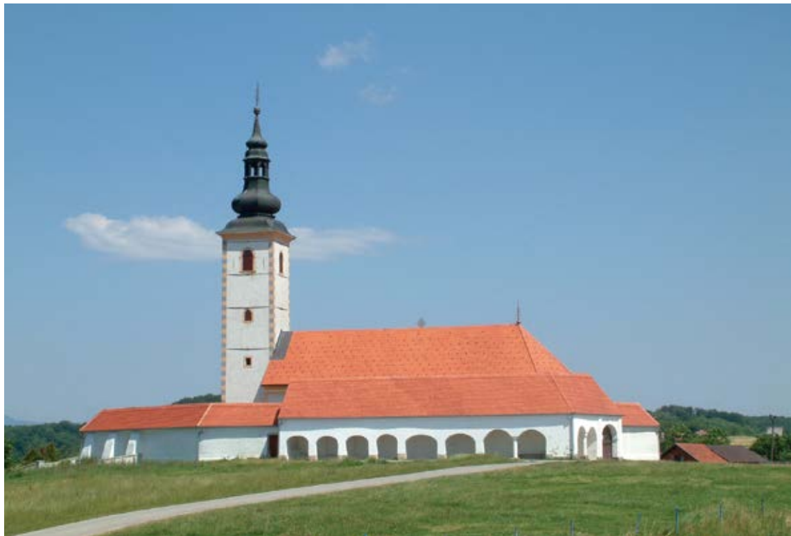
Church of the Holy Three Kings, Komin

IN THE 12 TH CENTURY, Zelina was first mentioned by the Croato-Hungarian King Bela III in a document confirming the right of the Zagreb canons to the Zelina estate. The Church of St. John the Baptist on the hill was first mentioned in 1200. The development of a free trading town began when Ban Mikac Mihaljević issued a document in 1328 on its freedom, inviting “people of the free class who wish to live in the free village of the master of our region Zelina”. Like other trading towns, the town began to develop along the road Zagreb–Varaždin. The centre is the main town square before the parish church.