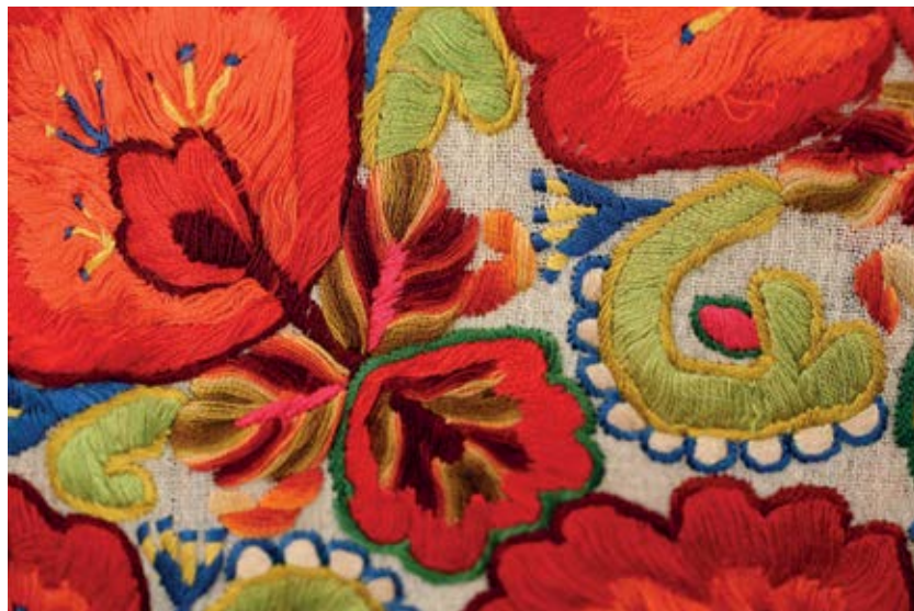
Traditional motifs and the embroidery characteristics of Zagreb County

This 19 th century wooden church was constructed in the traditional style, using oak planks joined using the German corner technique. There is a narrow veranda on the facade, with a small shingled belfry rising above it. The nave has a wooden hip vaulted ceiling. The church contains the valuable altar of the Crowning of the Mother of God that dates back to 1749. From the old altar, a small retable has been preserved, while the mensa, or altar top, is new. The altar painting depicts the Crowning of the Mother of God. Statues to St. George and St. Florian are skilled works by unknown masters. A statue of St. Michael surrounded by angels stands on the attica. The retable is a valuable Baroque piece.