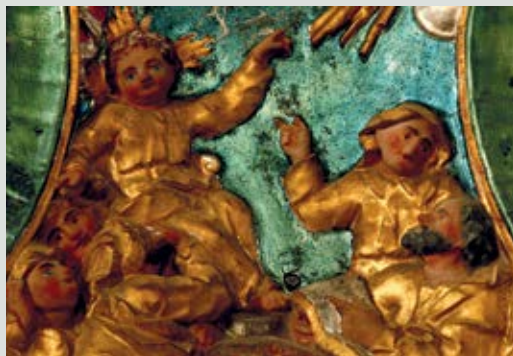
Detail of a wall ornament