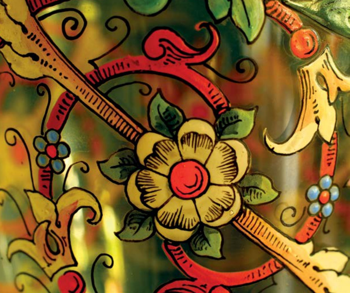
Detail of a hand painted glass vase, Samobor Museum