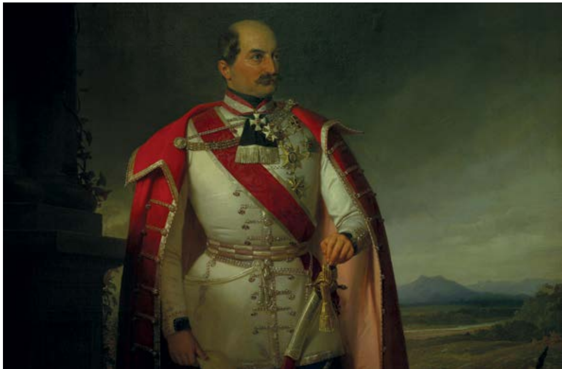
Ban Josip Count Jelačić Bužimski (1801–1859)