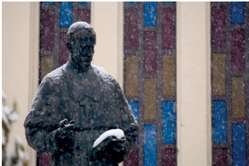
Sculpture, Blessed Cardinal Alojzije Stepinac