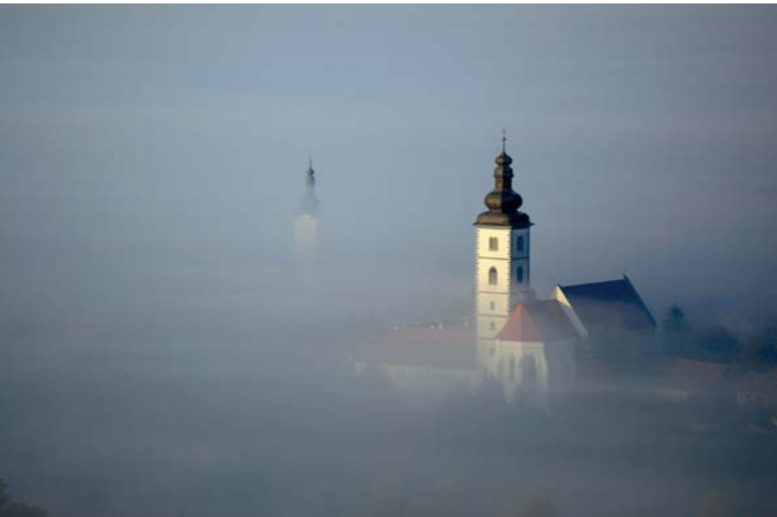
Towers of the Church of the Assumption of the Blessed Virgin Mary and the Church of St. John the Baptist