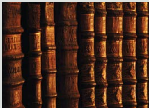
Archive of the Franciscan Monastery