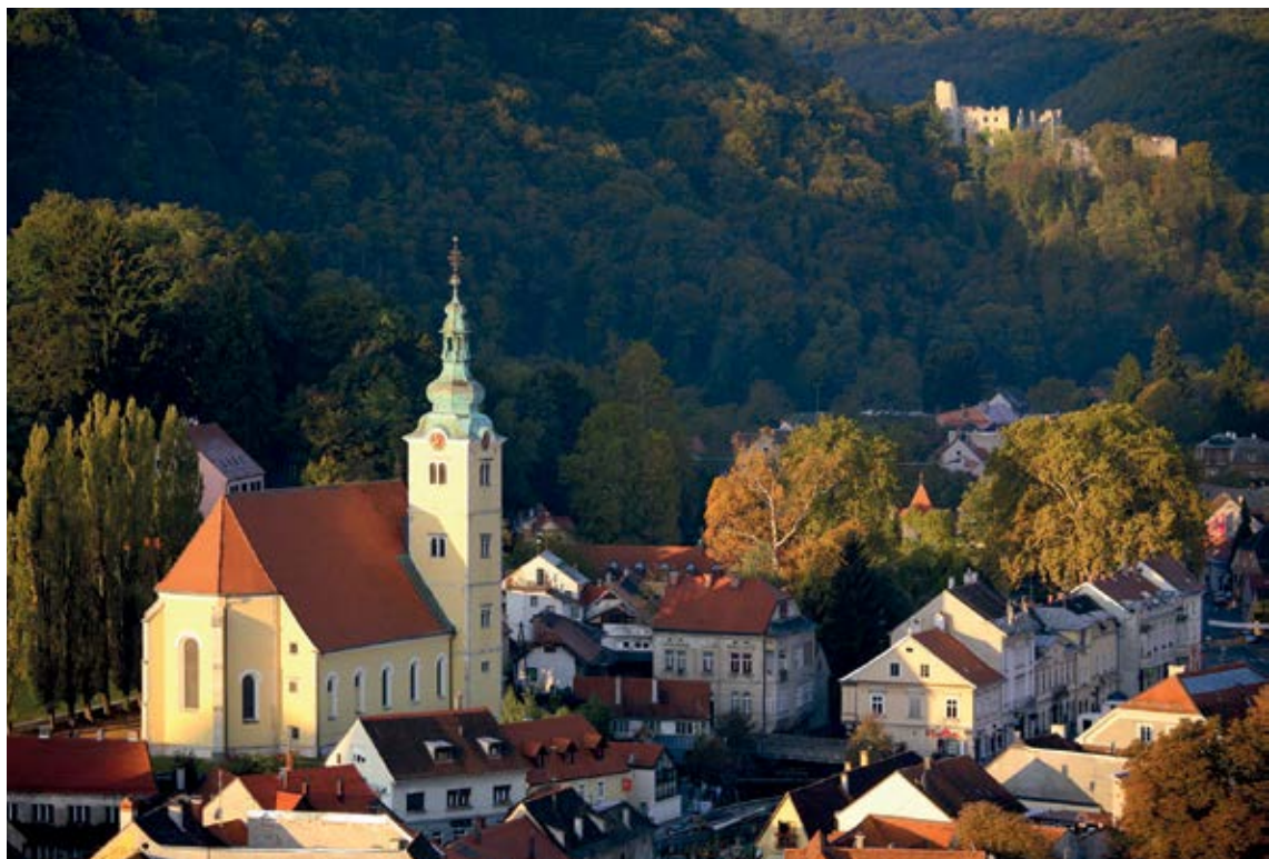
Centre of Samobor and the Old Samobor town

SAMOBOR IS SITUATED IN the narrow valley of the Gradna stream, under the old noble town. In 1242, King Bela IV granted the people of Samobor a charter giving the town the status of a free royal trading town. The town experienced organic growth, and in line with the needs of the population, irregular streets appeared spontaneously. The main town square is in the centre and many of these streets lead to it. The curved streets formed irregular blocks of houses. This urban matrix did not change until the 19 th century when the bourgeois construction of more representative houses in regular lines began. In terms of style, these are Art Nouveau or Historicist buildings. The town has remained like this to the present day.