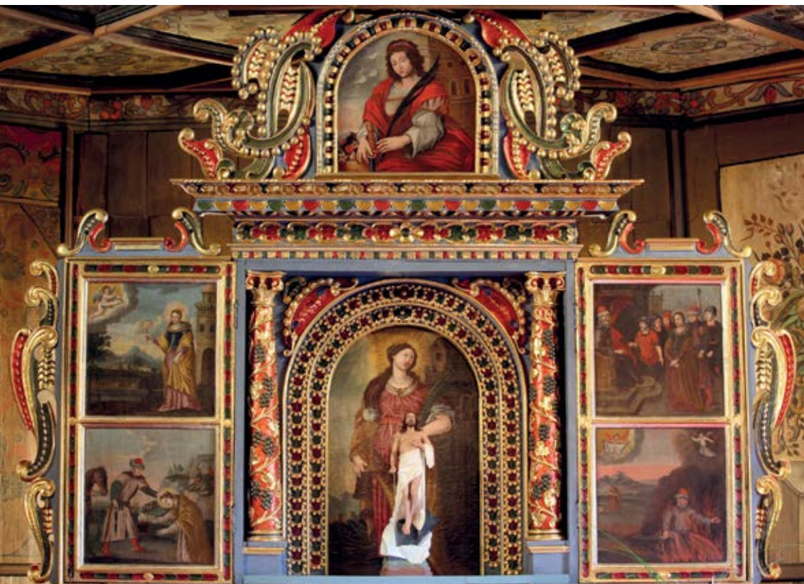
Open winged altar of St. Barbara from 1679

painter, presenting the expression of folk art inspired by the Baroque. The main altar of St. Barbara dates back to the 17 th century. The altar is a transition from the early medieval and Renaissance winged altars towards the three-part architecturally conceived retable that is typical in the Baroque. The altar has two wings on each side, the first of which are moveable. When the wings are closed, they depict scenes from the Passion of Christ, though when they are open, the centre is an altarpiece portraying St. Barbara, while the sides show scenes from her life. The church and its interior are a representative example of the Turopolje folk architecture and painting heritage.