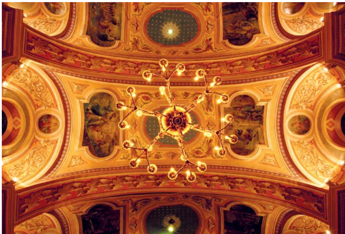
Ceiling vault of the Church of St. Peter the Apostle

IN THE PAST, Ivanić-Grad was a Renaissance fortress, constructed in the 16 th century in a wetland area, surrounded by a water moat ( wasserburg ). The position was excellent, as the Lonja River was used to fill the moat. Alongside the fortress, a number of small settlements emerged. Today, nothing remains of the fortress. In its place is the city centre, with park, parish church, magistrate building and old school. The crest of the town of Ivanić-Grad still bears a stylised tower – a memento of the fortress that no longer exists.