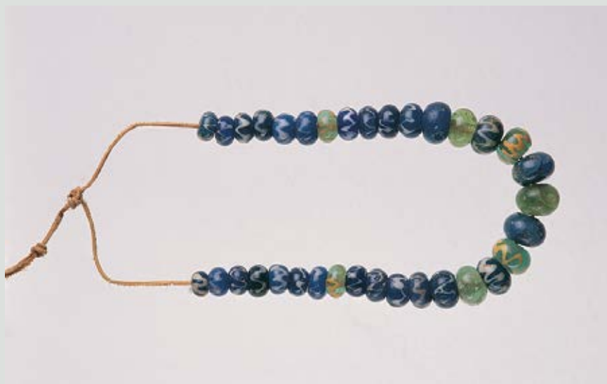
Budinjak glass bead necklace, 8–7 th century BC, Samobor Museum

Several of the archaeological finds have been joined together by a trail and turned into an Archaeological park — the Trail of Knights. This is an educational trail covering 4.2 km that passes 10 points of interest associated with the finds of prehistoric settlements from the cemetery in Budinjak (the knight's tumuli), the ancient cemetery in the village Bratelja and other interesting points regarding the cultural and natural heritage of this area. The trail starts at the Budinjak eco-centre, and the trail takes about 2 hours to cover.