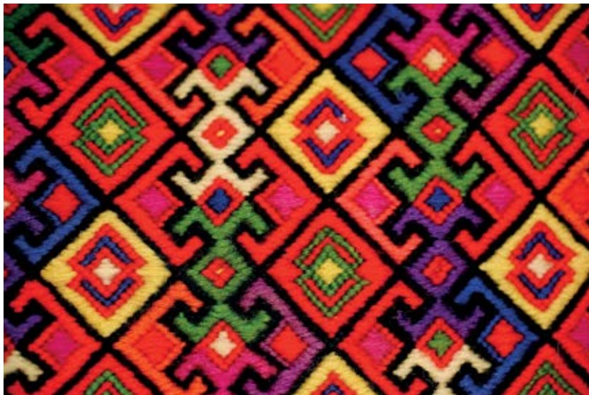
Traditional motifs and the embroidery characteristics of Zagreb County

The manor house is actually a Baroque palace, the likes of which are not found elsewhere in the impoverished borderlands of Žumberak. This is no surprise considering its construction was ordered by nobleman and Đakovo Bishop Josip Antun pl. Čolnić on his estate at Oštrc. The administration of the 11 th company of the Uskoks was stationed in the house for a time. The palace is traditionally called a manor house, as it was constructed and owned by a church official. For such structures, manor house was a more common title than palace.