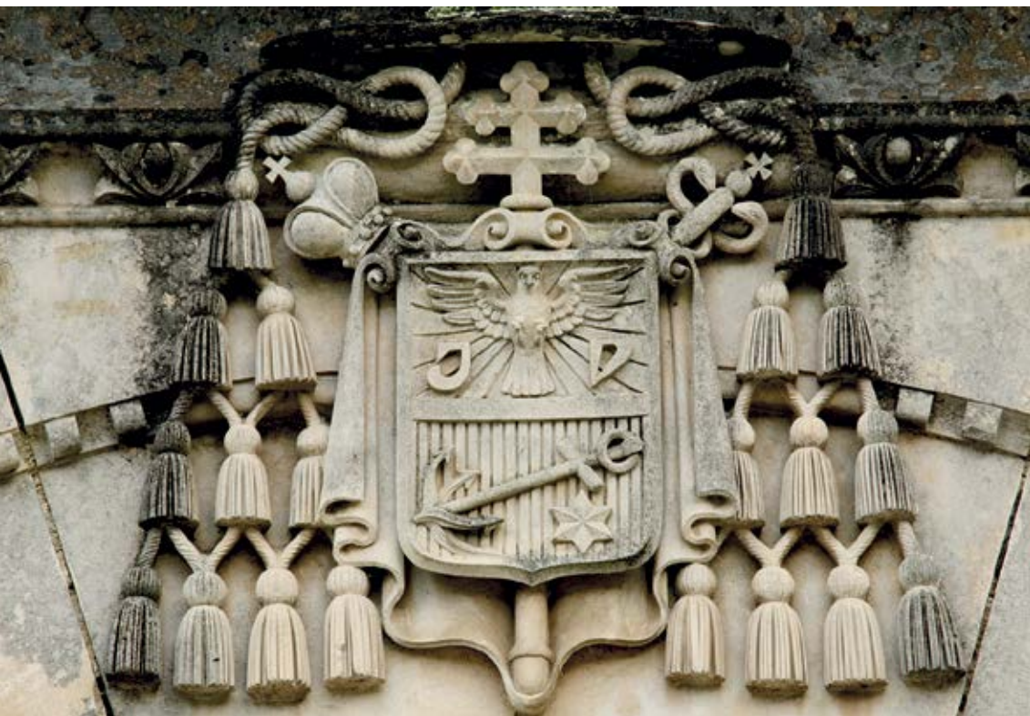
Detail from the façade of the Greek Catholic Church of the Annunciation, Strmac Pribički