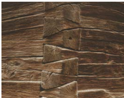
The German corner method of joining oak planks