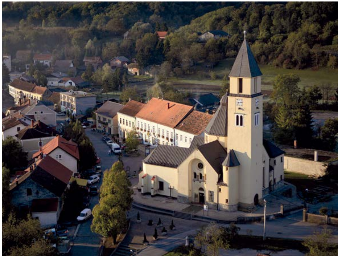
Church of the Most Holy Trinity

KRAŠIĆ HAS EXISTED AS a free municipality since the 15 th century. A square was formed at the crossing of roads, and the Church of the Holy Trinity on the square gives the settlement its spatial and visual accent. The buildings of Krašić have a small town and rural character. Examples of early Baroque, Historicism and Art Nouveau are evident, though the rural style is dominant.