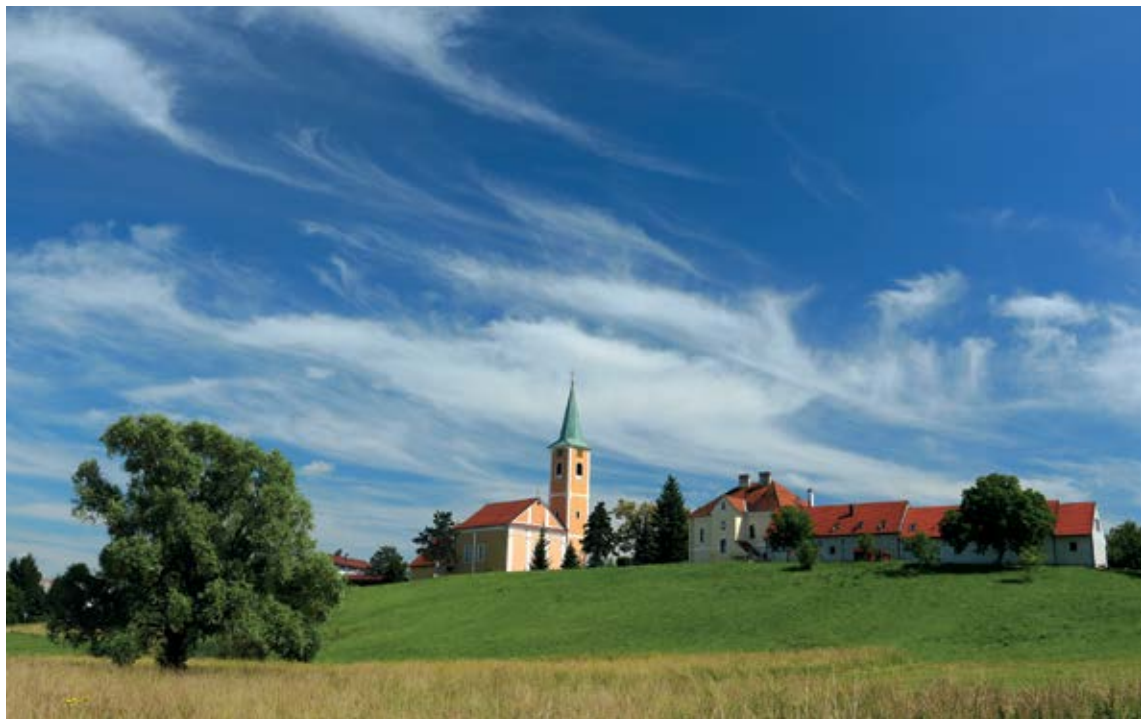
Parish Church of the Most Holy Trinity