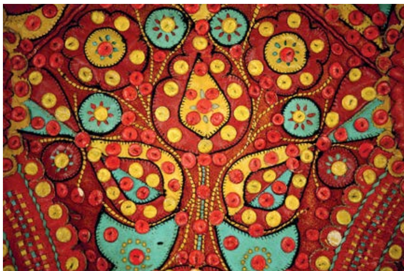
Traditional motifs and the embroidery characteristics of Zagreb County