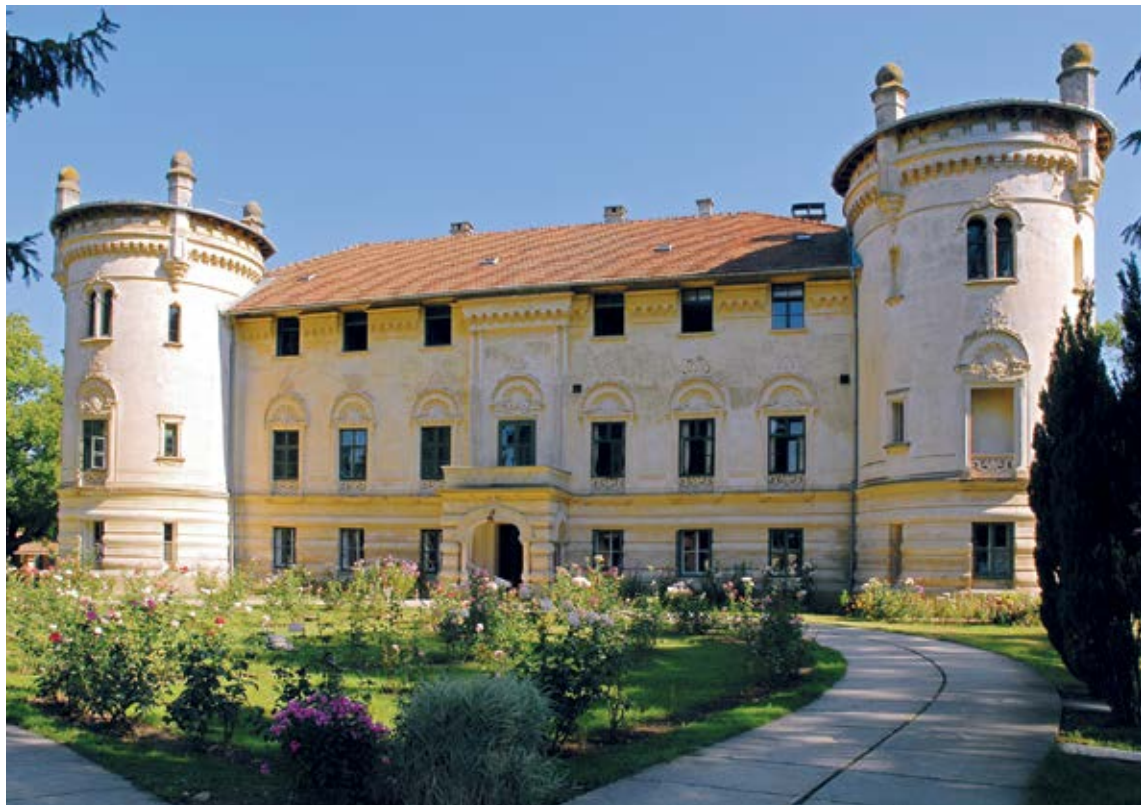
Lovrečina castle, Kućari