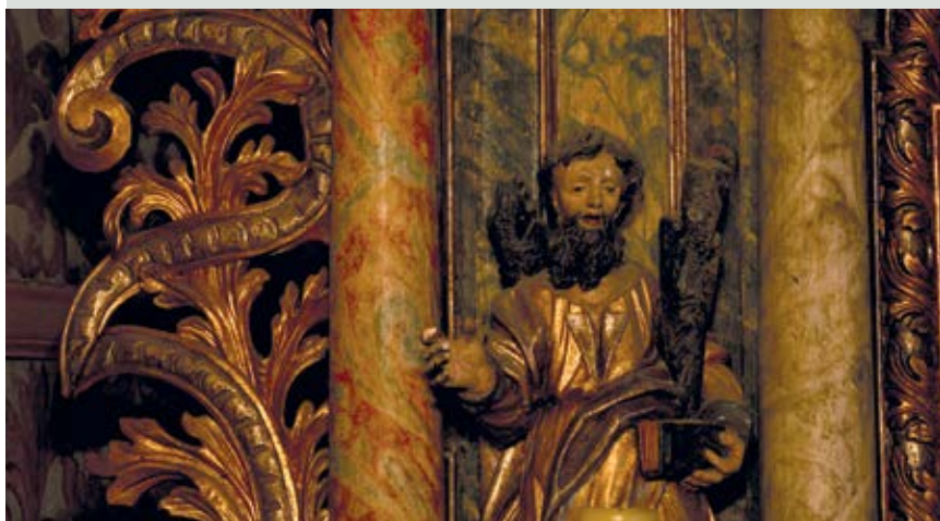
Chapel of St. George, detail of the wooden altar