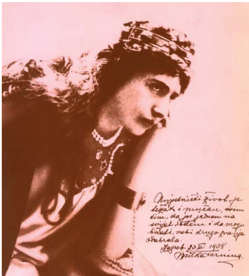
Katarina Milka Trnina (1863 – 1941), dramatic soprano

THE AREA OF THE municipality of Križ falls within the Posavina-Moslavina geographical area. The settlement was named after the Church of the Holy Cross (Križ = cross). In the 16 th century, the Križ Castle was first mentioned, and described as a smaller fortress at the edge of the Military Border, with a small staff of mercenary soldiers. At the turn of the 17 th century, the areas around the border fortress were settled by the population from Turkish areas, and thus arose the surrounding settlements. During the period of the Military Border, the settlement was named Military Križ . With the termination of the Military Border in 1873, Military Križ fell under the rule of the Ban (viceroy). After World War II, the word military was lost from the name, and it became simply Križ.