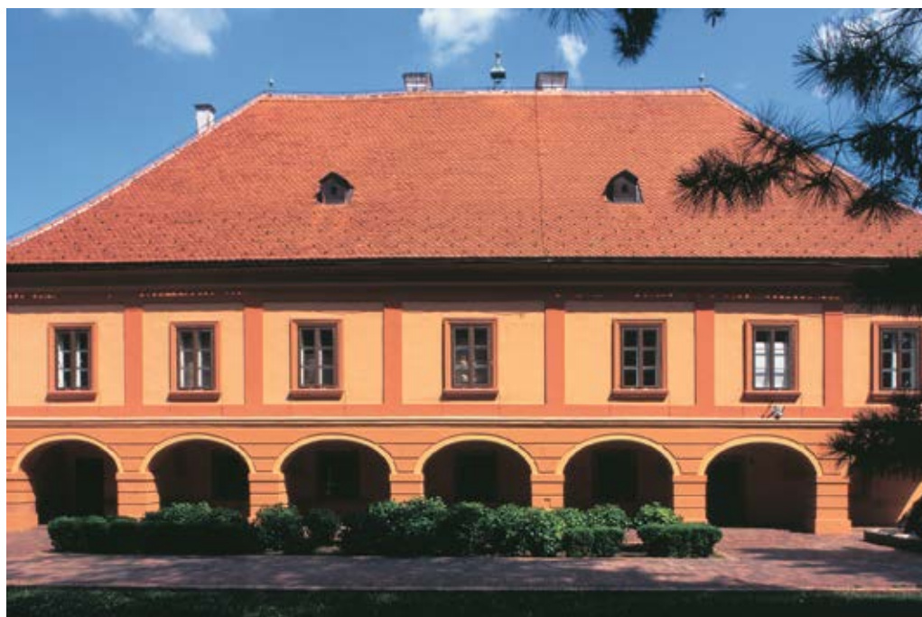
Council building of the 'Turopolje Noble Municipality'

① Trg kralja Tomislava 1, T 01 6221 325, E muzej-turopolja@muzej-turopolja.hr