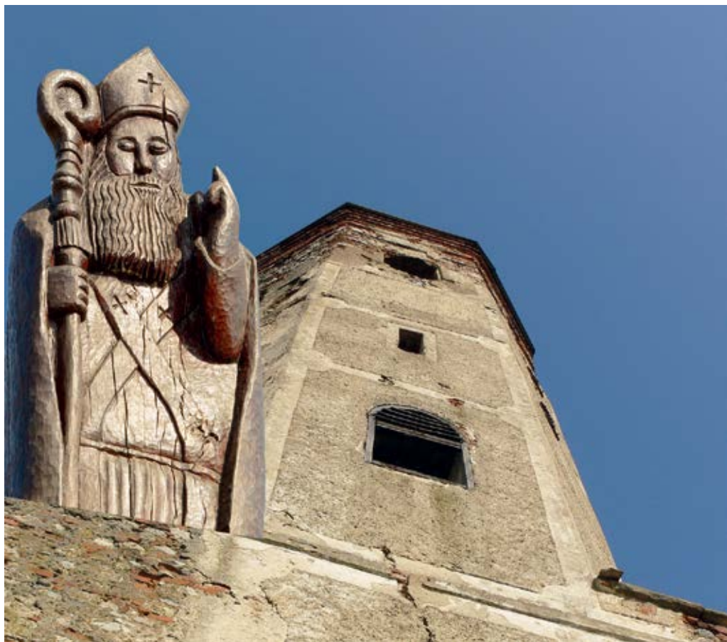
Church of St. Martin

THE SETTLEMENT EMERGED during the Middle Ages as a rural settlement. The estate of St. Martin was first mentioned in 1209, when it was bestowed to the Templar order of knights by the Croato-Hungarian King Andrija II. The Božjakovina estate, which included Dugo Selo, was in the hands of the Drašković family from 1685 until the termination of feudalism. In the 18 th century, the upper and lower villages were joined to form the present day Dugo Selo. Until the 20 th century, the primary architecture was based on wood, which gave a specific character to the settlement which has partly been preserved to the present day.