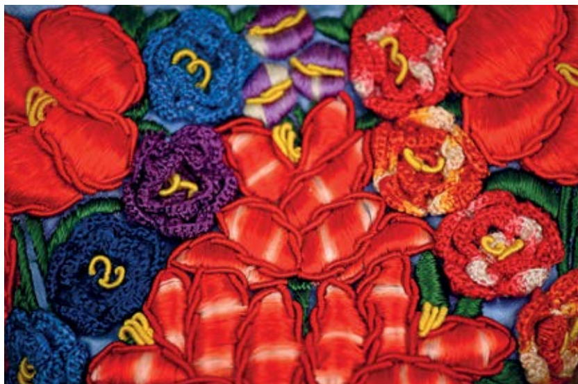
Traditional motifs and the embroidery characteristics of Zagreb County