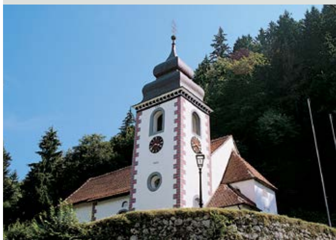
Church of St. Michael

Found under the Samobor Old Town. The church was originally Gothic, and later became a Baroque single nave structure. It was erected in the 15 th century, and later adapted and restored until the end of the 17 th century. The artfully divided volumes of the church bodies are complemented by the sacristy, entrance vestibule, covered bridge to access