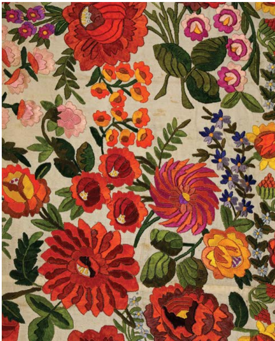
Traditional motifs and the embroidery characteristics of Zagreb County