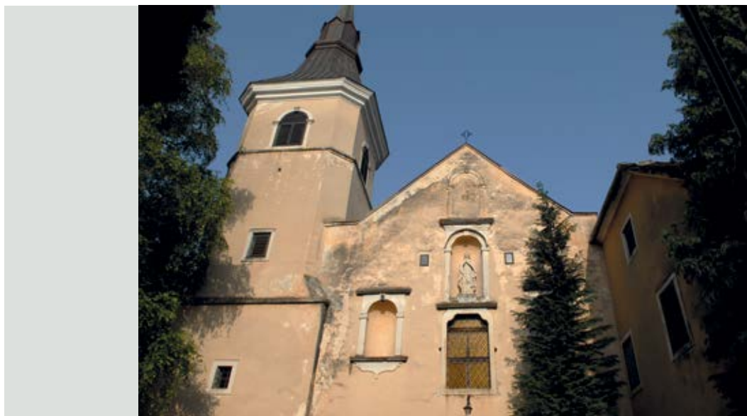
Franciscan monastery with the Church of the Assumption of the Blessed Virgin Mary

traces in the walls of the church testify to the presence of the earlier Gothic Dominican church.