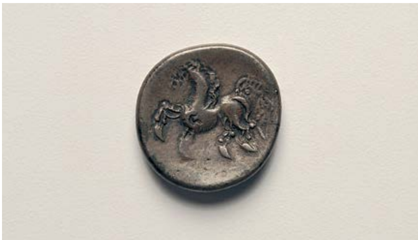
"Samoborac" — Illyrian/Celtic silver coin, 1 st century BC, Samobor Museum