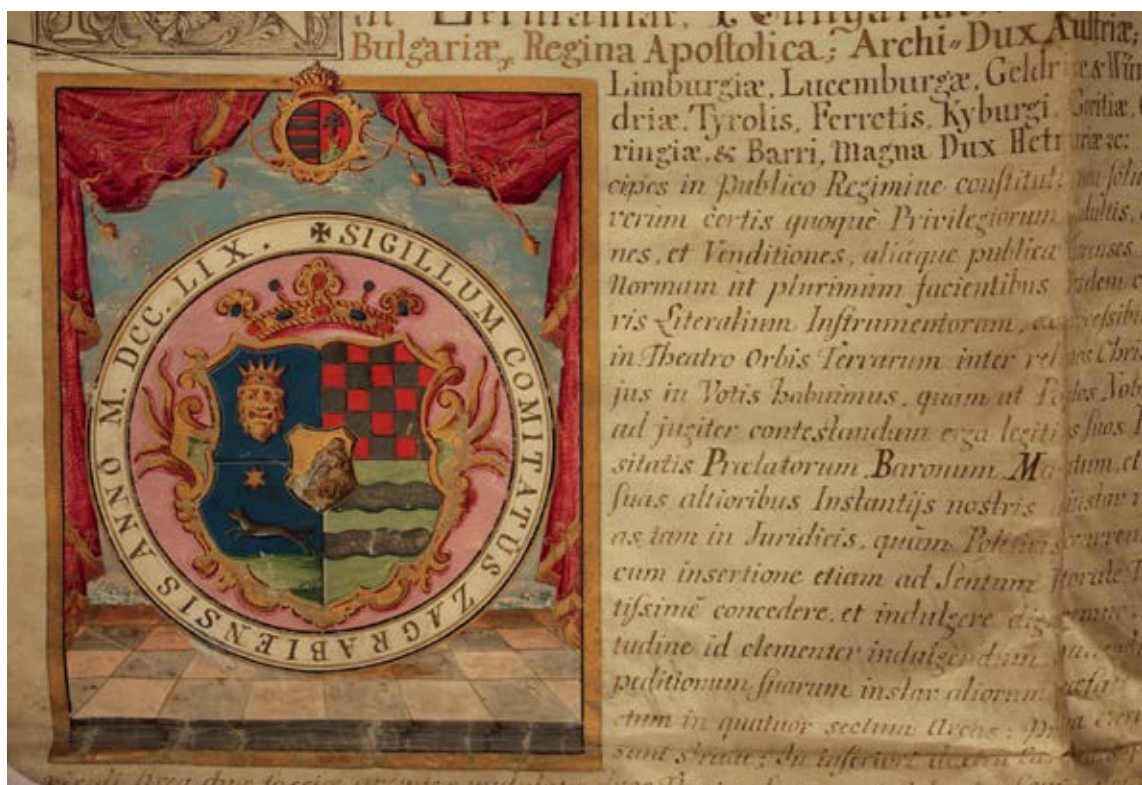
Grant of Arms of Zagreb County, 1759, Croatian State Archive