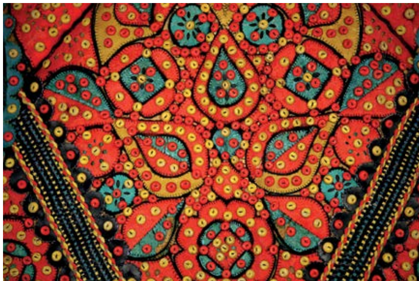
Traditional motifs and the embroidery characteristics of Zagreb County